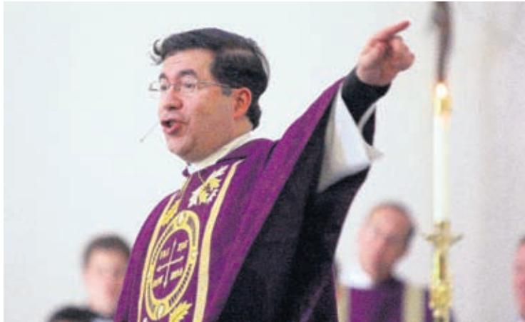
Frank Pavone, head of Priests for Life, gives the Homily during a mass at Ave Maria University's Oratory in Naples, Fla., on March 31, 2009 to recognize the fourth anniversary of Terri Schiavo's death.

Pavone had been investigated by his then-diocese of Amarillo, Texas, for having placed an aborted fetus on an altar and posting a video of it on two social media sites in 2016. He posts frequently about U.S. politics and abortion, and the video of the aborted fetus was accompanied by a post saying that Hillary Clinton and the Democratic platform would allow abortion to continue and that Donald Trump and the Republican platform want to protect unborn children. Pavone remains a firm supporter of Trump: His Twit-